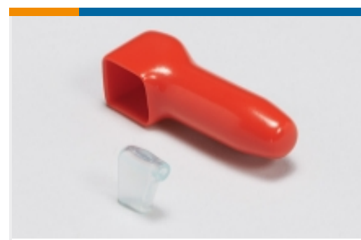
Insulation Boots &amp; Sleeves(7)